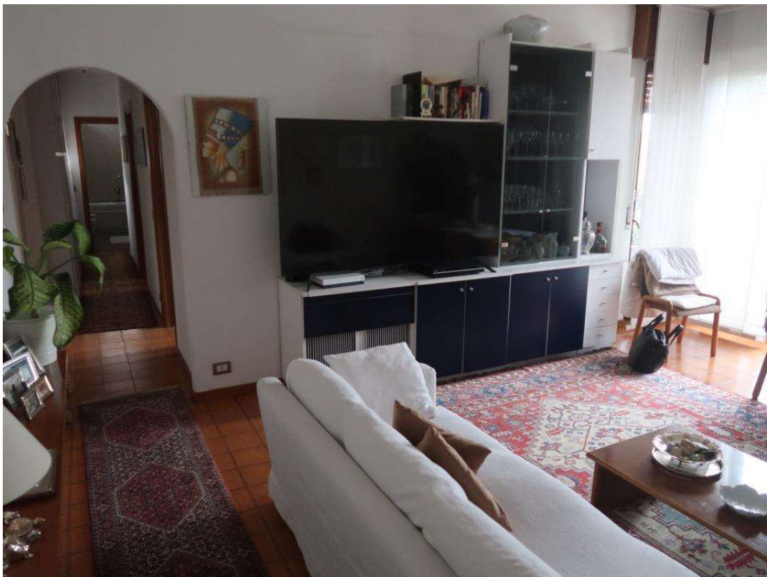
SOGGIORNO FOTO 2