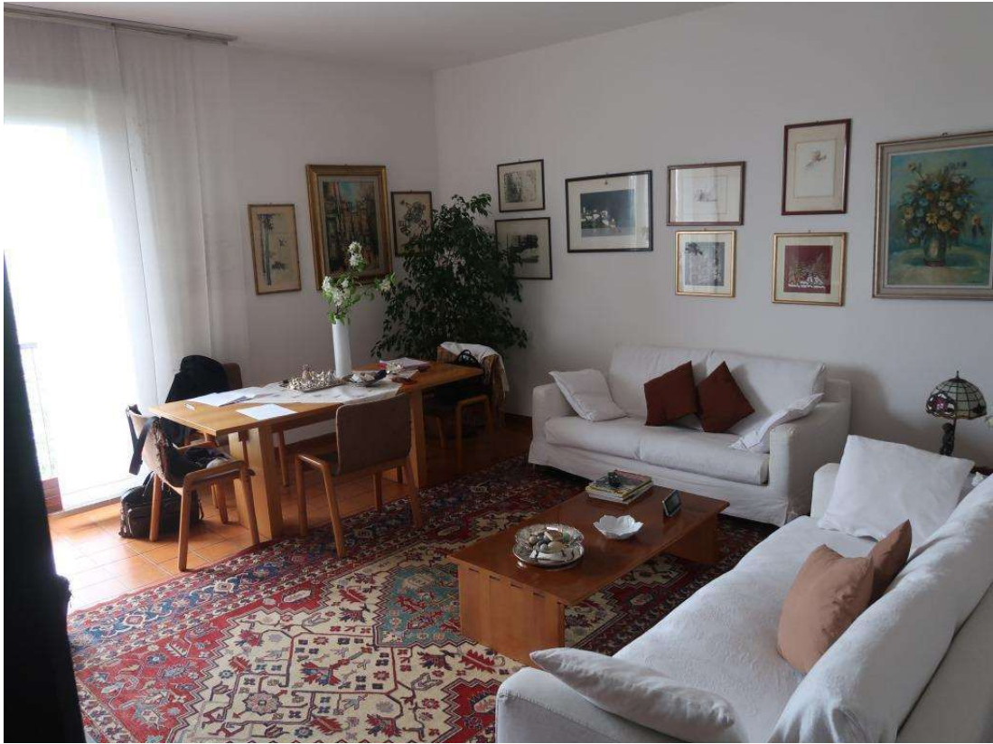
SOGGIORNO FOTO 1